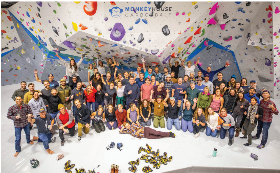
A big part of Backbone Media’s 60 or so employees were hanging out at another millennial-style business in Carbondale, the Monkey House on Highway 133, putting themselves through the kinds of paces they might encounter out in the wilds.

milestones in their timeline that helped broaden the business.